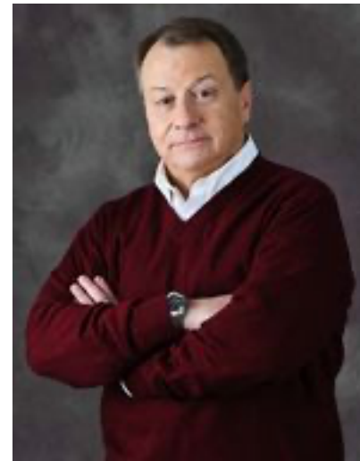
MASSACHUSETTS FAMILY INSURANCE